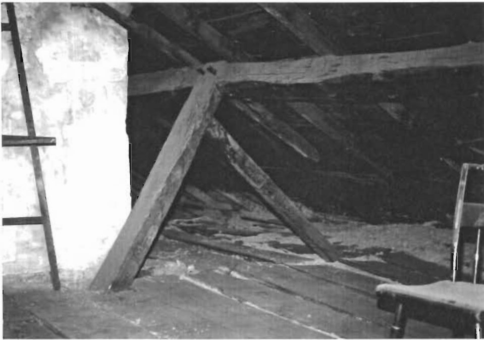
EXT - 43