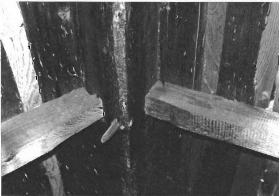
EXT - 45